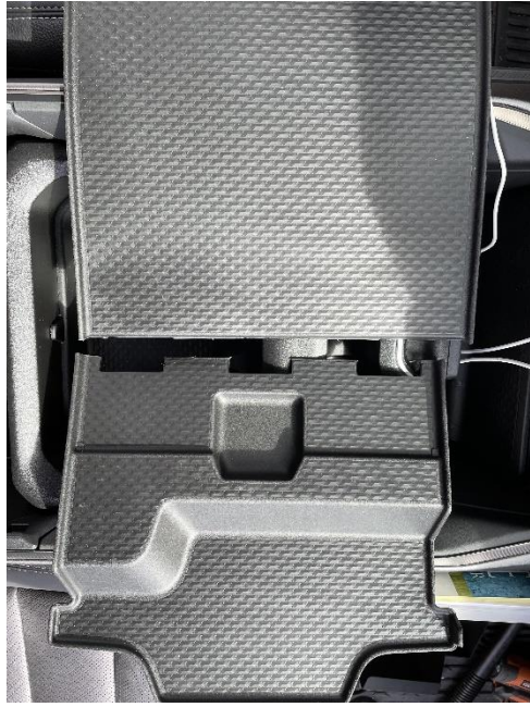
Image 1: Where to cut the mat (re-insert top part back into console)